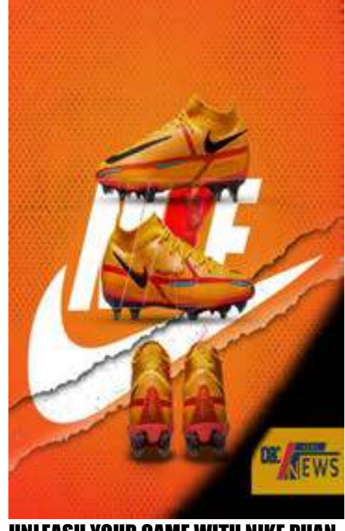
UNLEASH YOUR GAME WITH NIKE PHAN-TOM