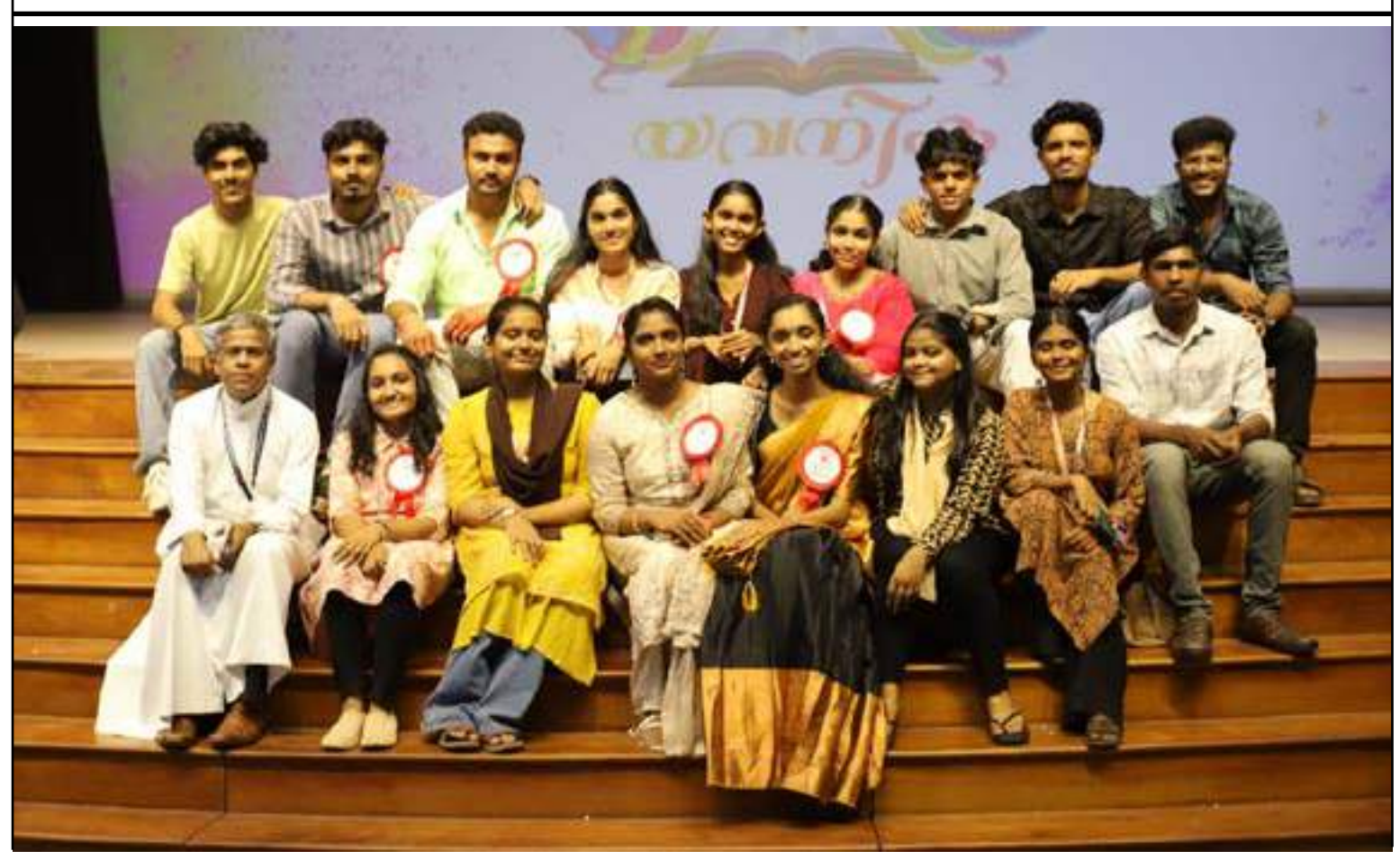
BBA Celebration Don College: at Bosco Day Arts College Exceptional Contribution Arts Union's the and

The two-day Arts Day event talent of students from the fac-January 30th and 31st, was an through a diverse range of perimpressive celebration of creexcellence. The event brought together students from varifaculties, each showcastheir talents through a of performances variety and This exhibitions. year's Arts Day was marked by the stelfaculty, which won the coveted "Win the Arts" title, and the College Union's invaluable contribution making the in resounding a event success. The Business Administration (BBA) department emerged as the ultimate victor of Arts Day 2025, winning the "Win the title. Their success was and a culmination of hard work, The College creativity, and the remarkable crucial